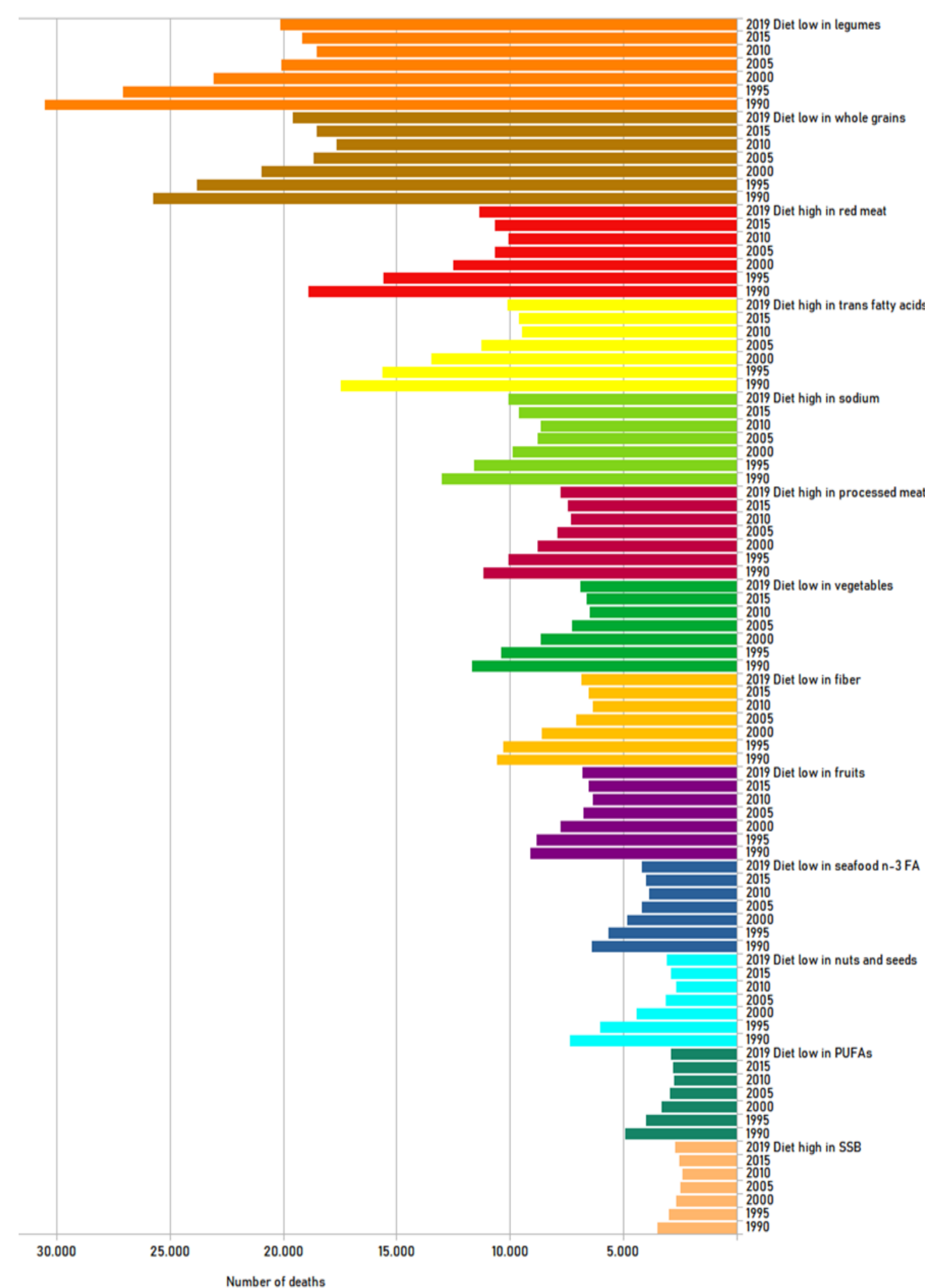
Figure 2: DRCDs from 1990 to 2019 in Germany.

Most DRCDs in Germany were caused by a diet low in legumes (20,152 deaths, 17.9%; WHO ER second place with 15.0%), followed by a diet low in whole grains (19,593 deaths; 17.4%; WHO ER first place with 21.1%) and a diet high in red meat (11,357 deaths; 10.1%; Figure 2 and 3). In the WHO ER a diet high in sodium took third place (12.3%). Overall, 83.6% (WHO ER 80.3%) of the deaths could be attributed to ischemic heart disease, which was also the main cause of death in all countries. It is followed by ischemic stroke and intercerebral haemorrhage with 8.8% and 3.3% respectively (WHO ER 11.3% and 4.7%) (Figure 3).